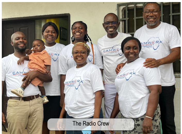
The Radio Crew

The next broadcasting move is to start posting gospel contents online since this has proven to provide a quantifiable audience. To this effect, a planning meeting was held on the 9th of November 2025.