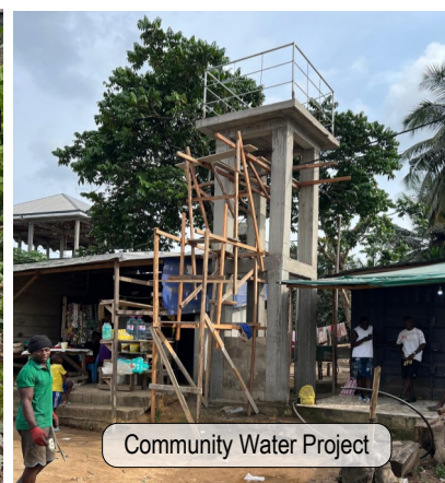
Community Water Project