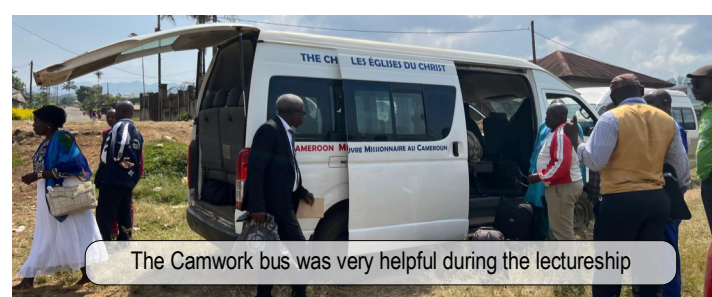
The Camwork bus was very helpful during the lectureship