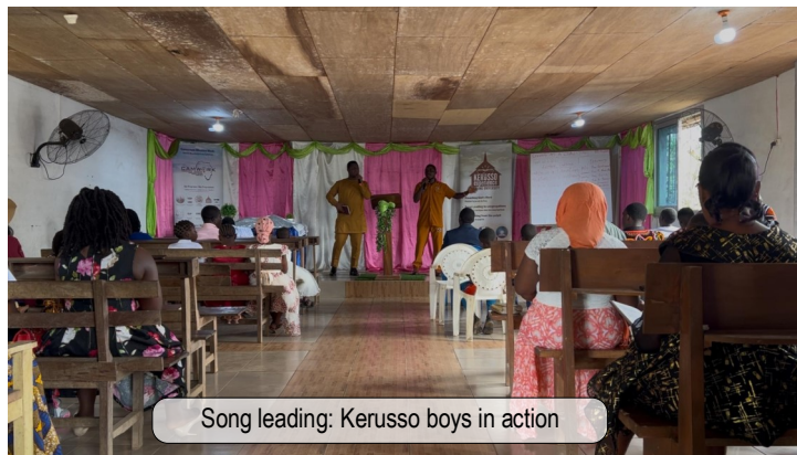
Song leading: Kerusso boys in action