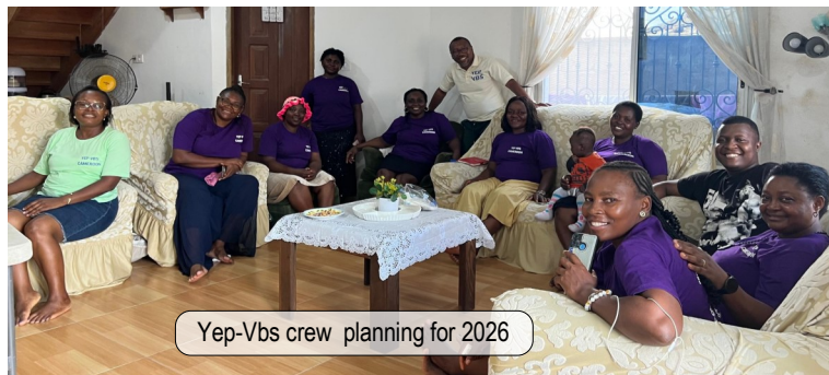
Yep-Vbs crew planning for 2026