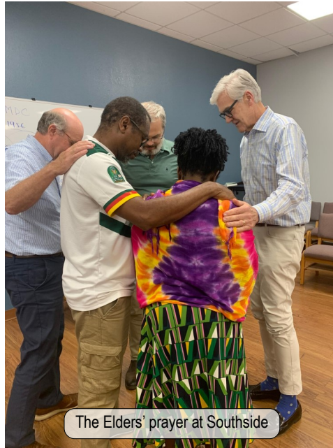
The Elders' prayer at Southside