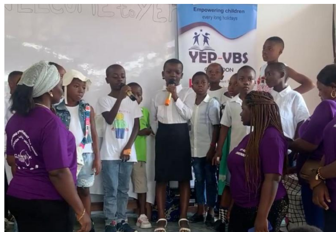
Closing ceremony activities

POSITIVE OUTCOMES: Four hundred and thirty-three children and forty facilitators gained moral lessons on how to shine their light for Christ through love, courage, obedience, kindness and how to make good choices.