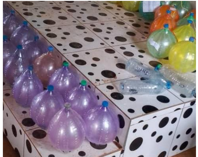
Waste plastic bottles into balloon bulbs