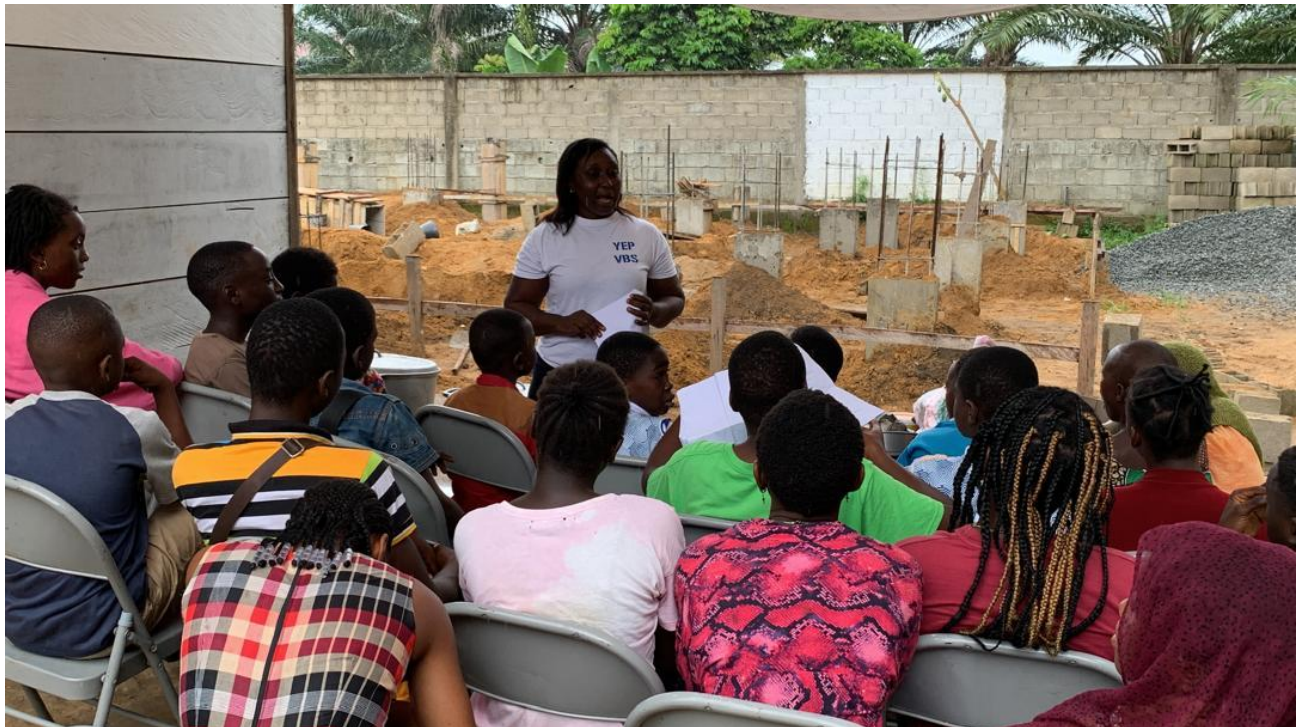
Sex Education class in Bomono

This year during the sex education class, the older children were taught what LGBT stands for. As children of God, they were encouraged not to indulge into such acts because the Bible condemns them. God's plan is for male and female to get married and procreate to fill the earth. If same sex people get married, how will the human race continue to exist? The human race will surely be extinct.