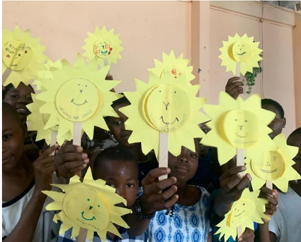
Smiling face sunlight