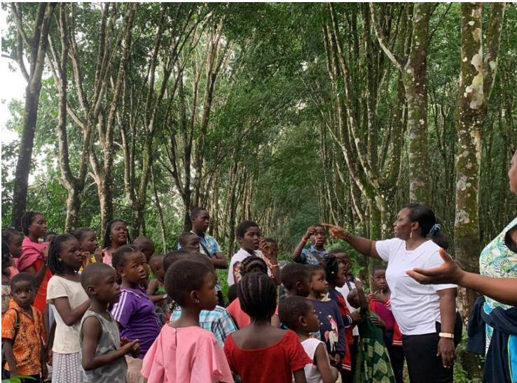
Admiring the trees and talking of its importance