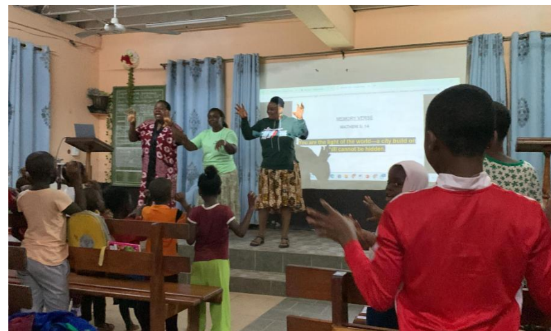
Watching and practicing the song "Shine like Jesus"