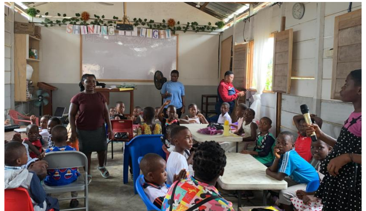
Lessons on children's rights and duties