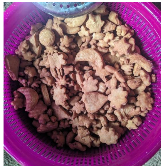
Heart shaped vanilla cake and various shapes of Cameroonian cookies (chinchin)