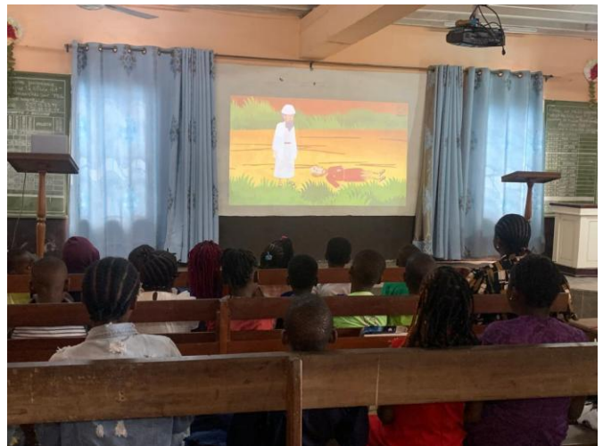
Watching the Good Samaritan story