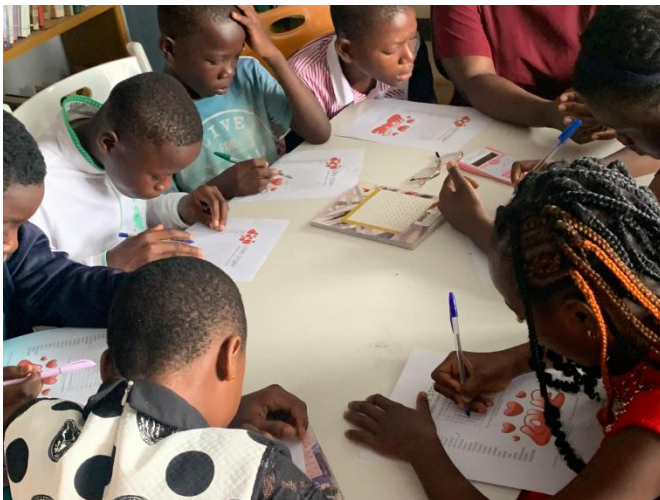
Word search on the love lesson

4. Repentance. Just like the prodigal son, the children learned the importance of repentance. Whenever you make mistakes, you can always go back to ask for forgiveness. Also whenever someone is sorry for what they did wrong, God always forgives. They learned how to forgive others just like the prodigal son's father. In that way, they shine Christ's light.